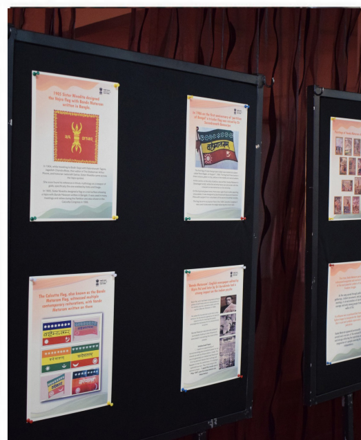
Exhibition panels highlighting the history and legacy of Vande Mataram.